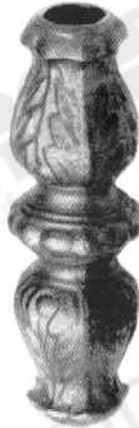
32d/1 40●x130mm 16mm●hole