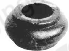
32d/5 33●x20mm 16mm●hole