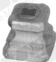
33/15 40x40mm 12mm ■hole