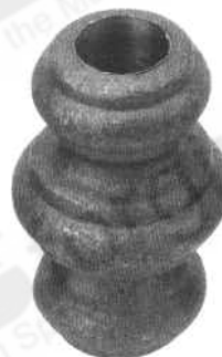
33/3 78x50mm Drilled 20.5mm