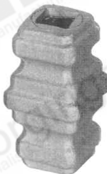
33/18 80x45mm 16mm ■hole