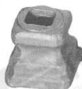
33/17 50x45mm 16mm ■hole