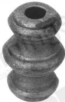
33/2 78x50mm Drilled 16.5mm