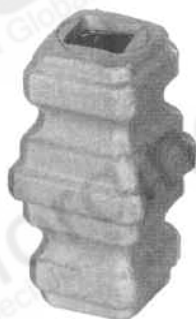
33/16 68x40mm 12mm ■hole