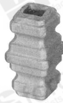
33/20 68x40mm 16mm ■hole