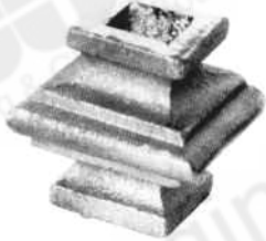
32d/6 48■x48mm 16mm■hole