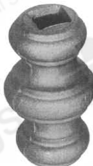
33/19 67x45mm 16mm ■hole