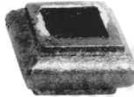
32d/8 33■x20mm 16mm■hole