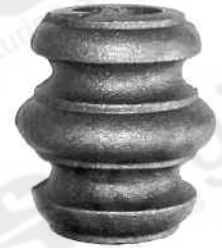
44/51 76x90mm 30mm ● Hole