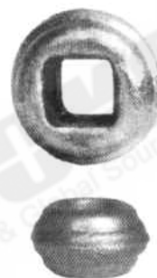
33/9 23x40mm ● 16.5mm ■ Hole