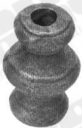
33/1 65x40mm Drilled 12.5mm 33/1a 65x40mm Drilled 17mm