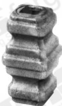
33/8 88x45mm 16.5mm ■ Hole