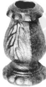
32d/2 40●x75mm 16mm●hole