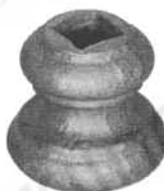
33/13 47x50mm 16mm ■hole