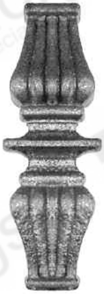
44/49 150x50mm 16mm ■ Hole

**Malleable Cast Iron Bushes - Not Recommended For Galvanising**