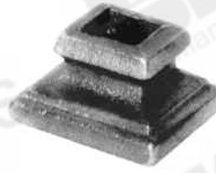
32d/9 48■x30mm 16mm■hole