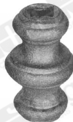
33/14 80x50mm 16mm ■hole