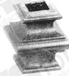
32d/4 40■x45mm 12mm■hole