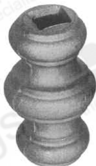
33/12 67x40mm 12mm ■hole