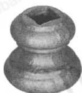
33/11 39x40mm 12mm ■hole