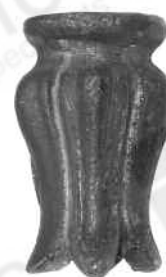
33/10 82x50mm 20mm ● Hole