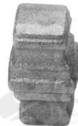
33/4 88x45mm ■