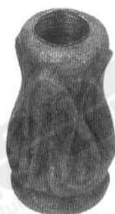
33/6 63x32mm ● Drilled 12.5mm 33/7 63x32mm ● Drilled 16.5mm